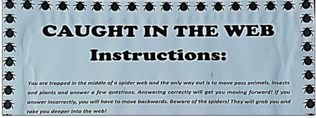
Figure 2. "Caught in the Web" board game instructions

To support the verbal responses provided by participants 2 and 7, photographic footage of the educational science board game developed by participant 5 was considered. A closer look at the board game titled "Caught in the web" (see Figure 2 and Figure 3) confirms that the participant selected content topics that related to "plants", "animals" and "insects". These topics inform the natural science syllabus at primary school level. One further finds that participant 5 formulated written questions such as "If a plant did not have a stem, would it be able to grow upright?" and "In which habitat is this specific insect found?"