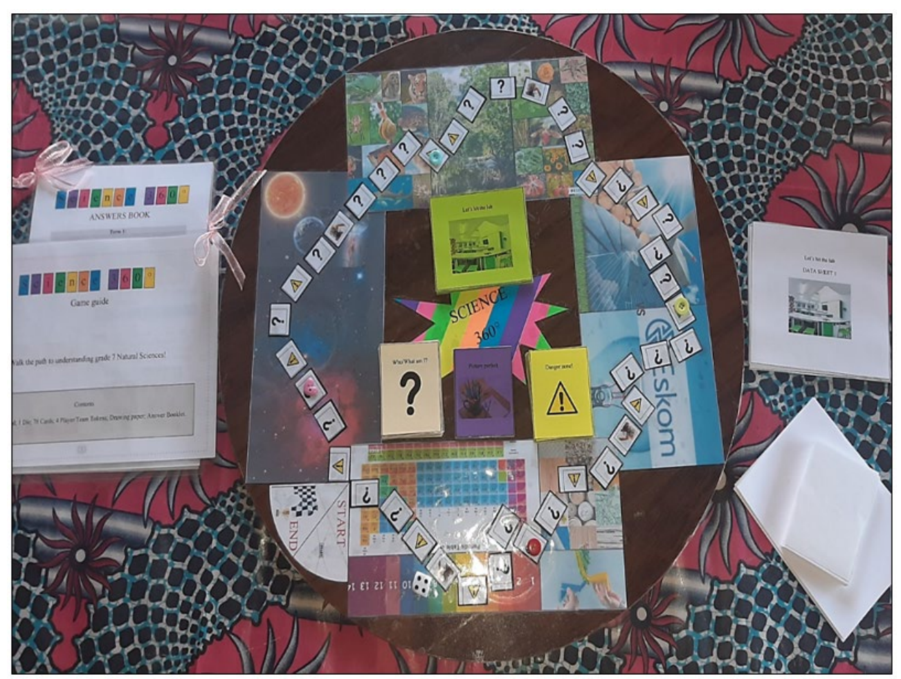
Figure 1. "SCIENCE 360"-A board game developed by research participant 7

Both responses by participants 3 and 5 suggest that the task to develop an educational science board game required a level of creativity, improvisation, planning and organization. In support of these verbal responses, photographic evidence of a board game developed by participant 7 resembles the level of creativity, improvisation, planning and organisation that the task required (Figure 1).